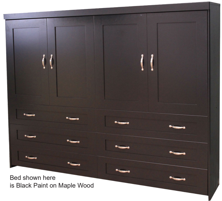
Bed shown here is Black Paint on Maple Wood

Requires standard, innerspring mattress up to 12" thick (not included.)