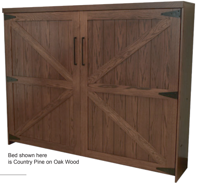
Bed shown here is Country Pine on Oak Wood

Requires standard, innerspring mattress up to 12" thick (not included.)