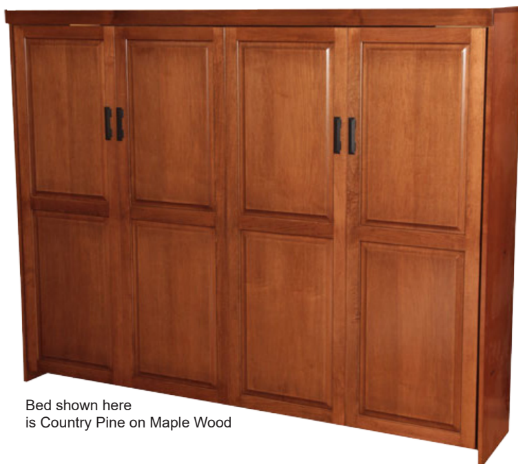
Bed shown here is Country Pine on Maple Wood

Requires standard, innerspring mattress up to 12" thick (not included.)