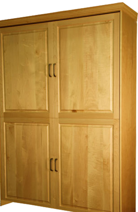
Bed shown here is Honey on Maple Wood