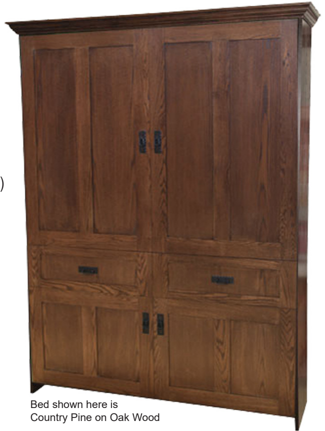
Bed shown here is Country Pine on Oak Wood