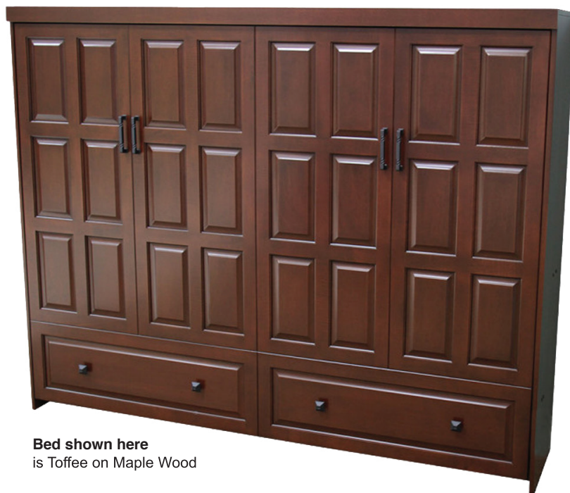
Bed shown here is Toffee on Maple Wood

Requires standard, innerspring mattress up to 12" thick (not included.)