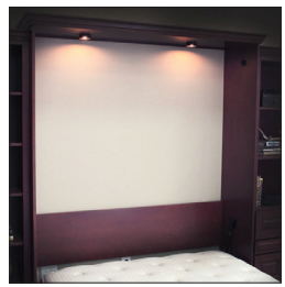
Side Cabinets Lighting (Refer to side cabinet sheet for more information.)