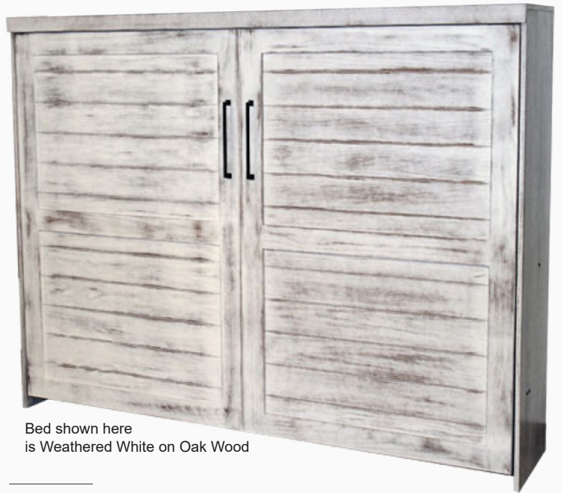
Bed shown here is Weathered White on Oak Wood

Requires standard, innerspring mattress up to 12" thick (not included.)