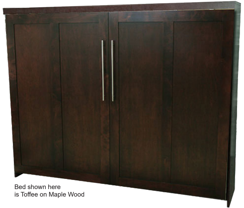
Bed shown here is Toffee on Maple Wood

Requires standard, innerspring mattress up to 12" thick (not included.)