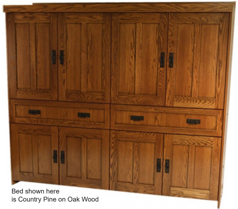
Bed shown here is Country Pine on Oak Wood

Requires standard, innerspring mattress up to 12" thick (not included.)